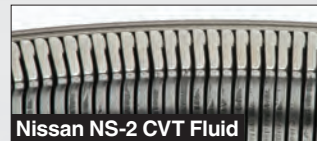
Nissan NS-2 CVT Fluid