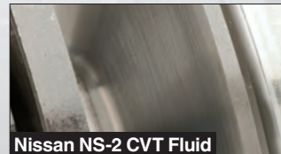
Nissan NS-2 CVT Fluid