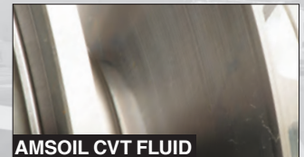
AMSOIL CVT FLUID